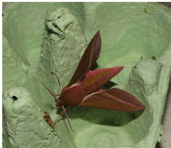
Elephant Hawk Moth photographed at the June 2005 Moth Evening