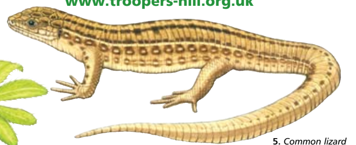
5. Common lizard